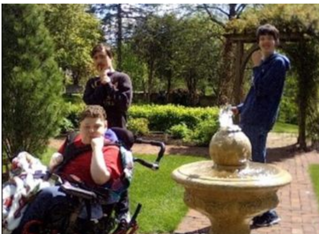
These gentlemen had a great time enjoying a beautiful spring day in the park!