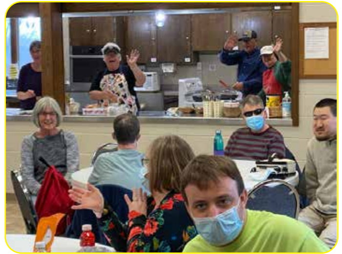
Our Day Hab group in Mt. Pleasant, Flexible Services, had fun taste testing at Meals by Nutrimos. Thank you for the invite!